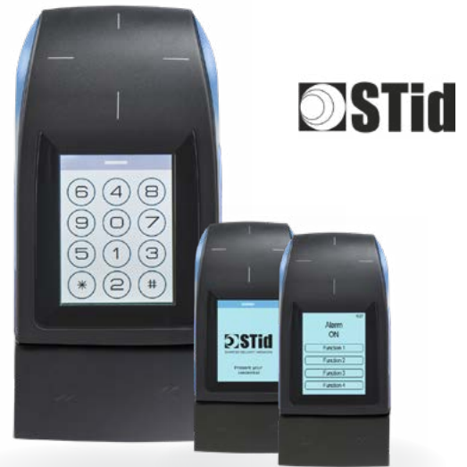
Display of your logo, images and customized text

The reader supports the use of public security algorithms recognized by specialized and independent organizations in information security (ANSSI French cybersecurity agency and FIPS).